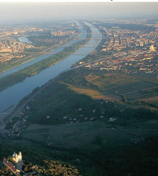
The Danube River