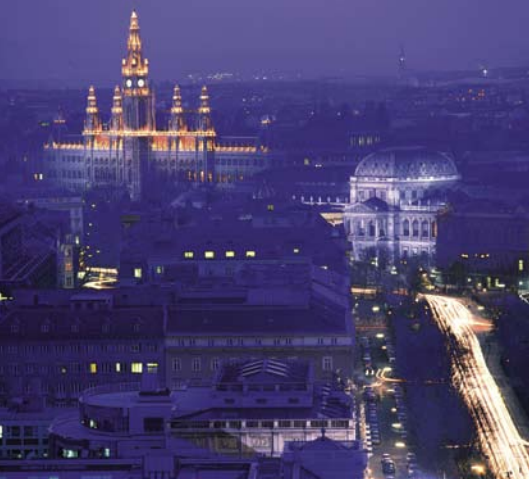
Over the roofs of Vienna: Ringstrasse © WienTourismus / F 3