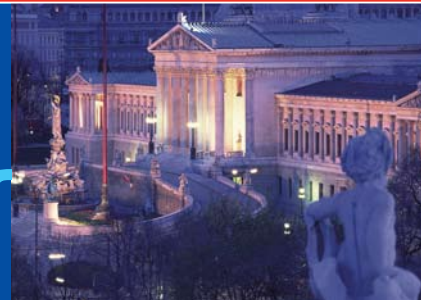
Parliament at night © WienTourismus / F 3