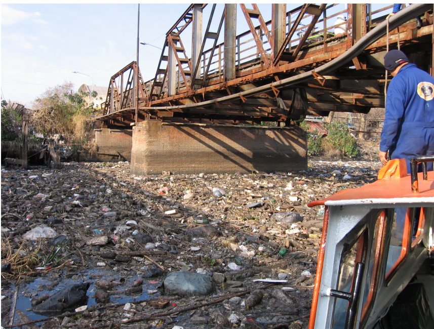
Solid waste on the La Plata River