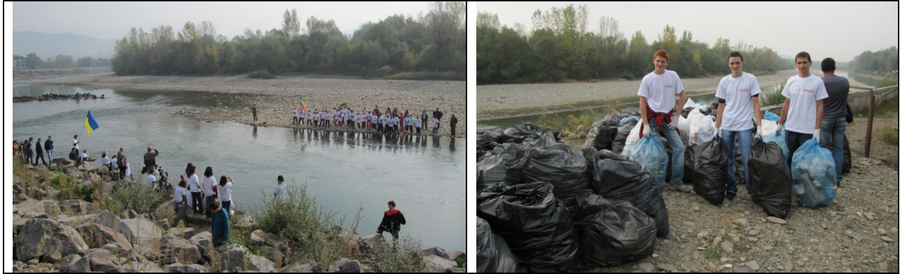
Two Banks – one clean Tisza