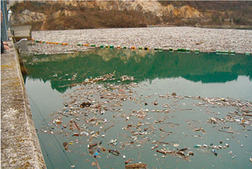
Flooding waste backs up behind the dam of the Višegrad power plant on the Drina River (a tributary of the Sava River within the Danube River Basin).

Plastic waste is often ignored as a 'problem' pollutant. However not only is a 'pollutant' that occurs globally there is growing concern of the impact on long-lived plastic waste and bottles in particular on open oceans. During the course of the UNDP/GEF Tisza Project it has been clear that plastic waste is not only a concern throughout the Tisza and Danube Basin (see Drina River photograph) but more widely. During an IW:LEARN project exchange the UNDP/GEF Tisza Project was host to visiting experts from the La Plata Project where the river also suffered from plastic waste forming rafts blocking the river. Potentially these rafts could lead to flood problems in high water conditions.