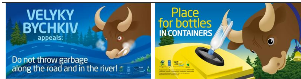
The two villages involved are Velyky Bychkiv (UA) and Bocicoui Mare (RO). The names of both translate as 'Great Bull'