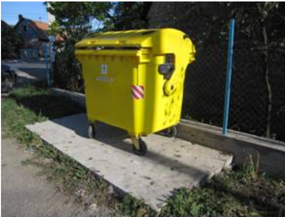
1100 litre communal waste container