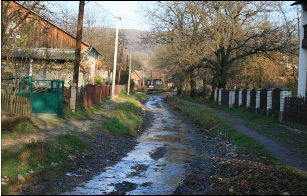
Picture 3. The stream at Duhnovich Street in Velyky Bychkiv

In the frame of the project it is proposed to study the hydrological characteristics of the streams and to develop Management plan for them. The main recommendations of the Management plan will be practically implemented in frame of construction works like making the river road safer against erosion using special pavement or stone armoring layer or widening flat riverbed part upstream to leave most of the sediments in case of flash floods or to built small dry pond. These works will be co-financed by the VB village council (around 40%), who confirmed its high interest for this output.