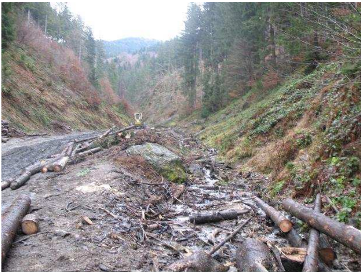
Picture 5. Destructed Loschansky torrent after wood cutting

In RO, the issue of small rivers conservation is also very urgent due to their pollution not only from wooden residues, but also nutrients. Project Partner in RO, Association of schools of commune of villages Bocicoiu Mare, Tisa, Crăciunești and Lunca la Tisa plans to conduct a number of practical actions to restore river streams and drinking sources out from them, using the developed methodology.