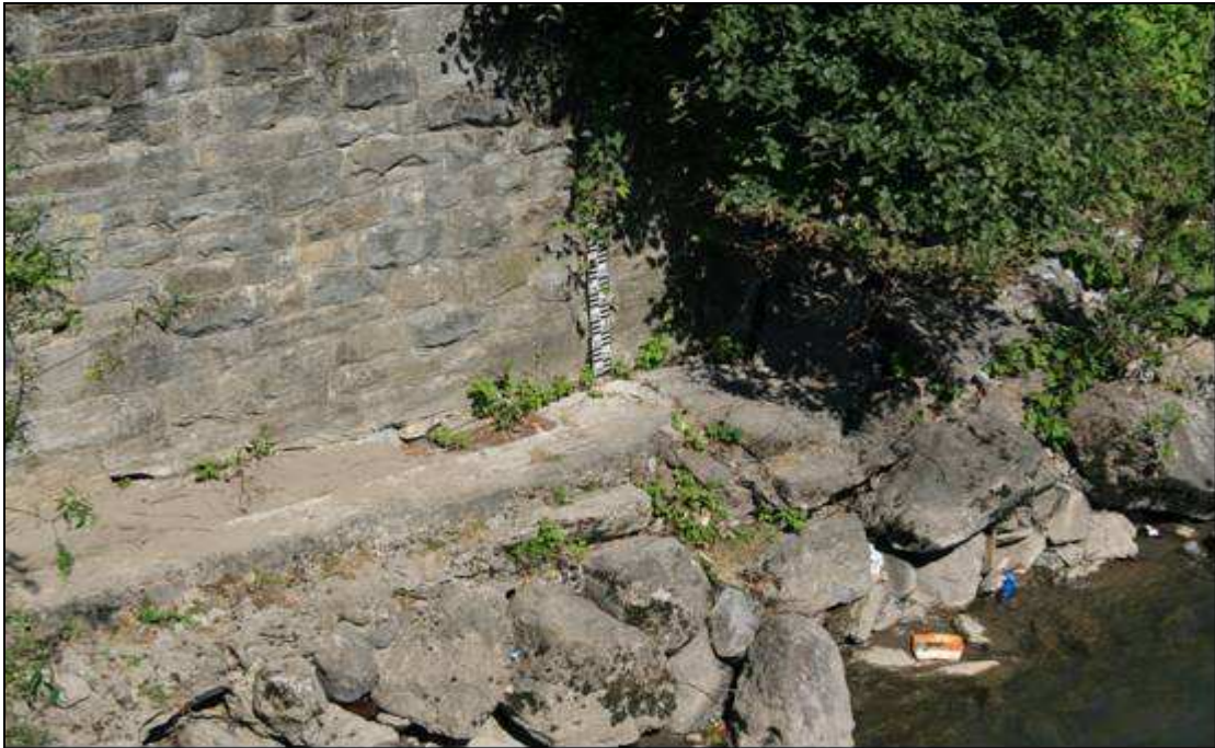
Picture 6. Present state of the water gauging station in Dilove

The station belongs to the network of Zakarpattya Hydrometeorological Center, Project partner. This organization will provide 60% of total budget of this station re-opening and maintenance, including installation of an automatic station, which underlines its need at this location and approves its sustainability.