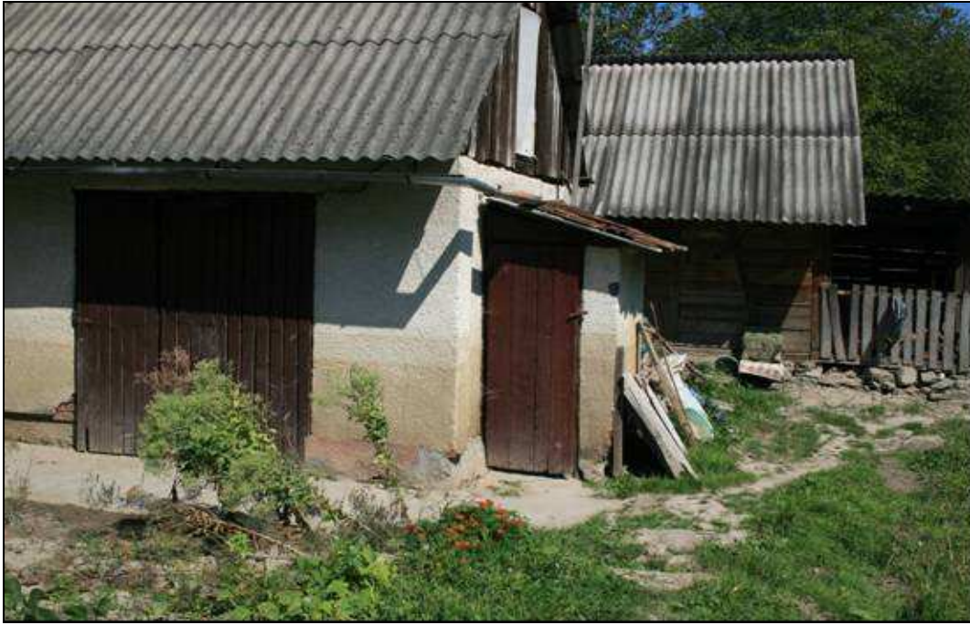
Picture 4. July 2008 flood level marks at the wall of a household in Velyky Bychkiv