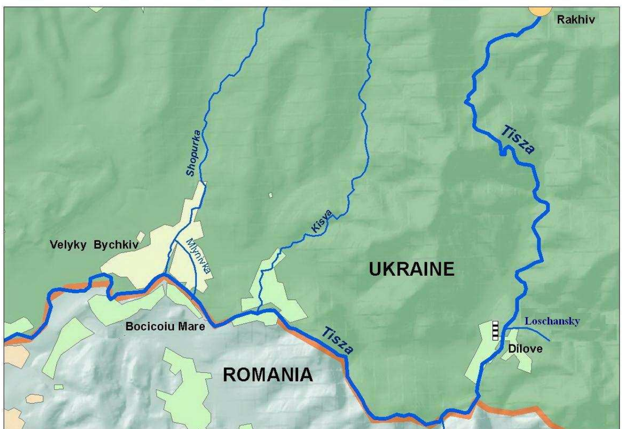
Picture 1. Project location

Historically these villages were one village, split into two parts after World War I. Despite of almost hundred years being split, the villages are culturally and mentally united.