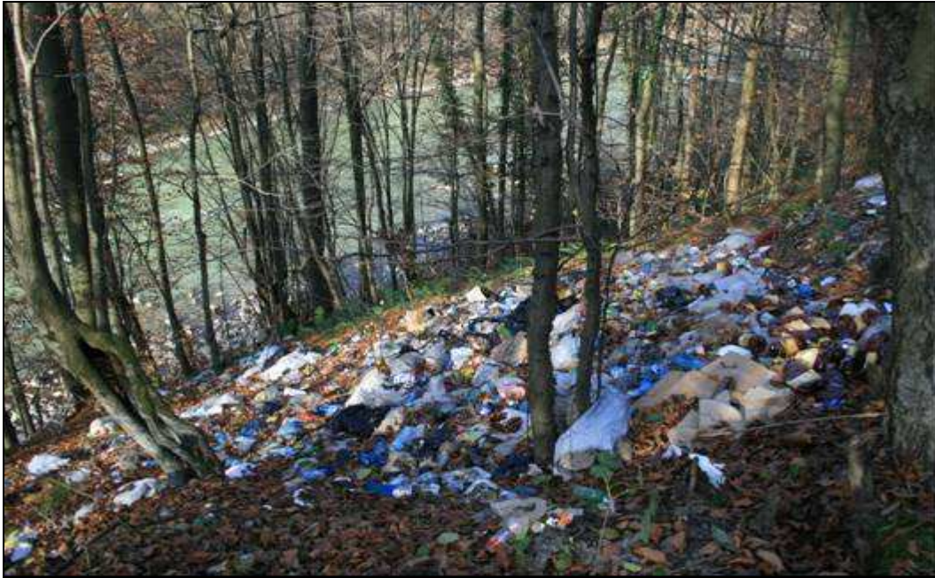
Picture 2. Waste disposals at Tisza river banks

Objective: to improve communal waste management system in Velykyy Bychkiv and Bocicoiu Mare for floodplain ecological potential preservation: