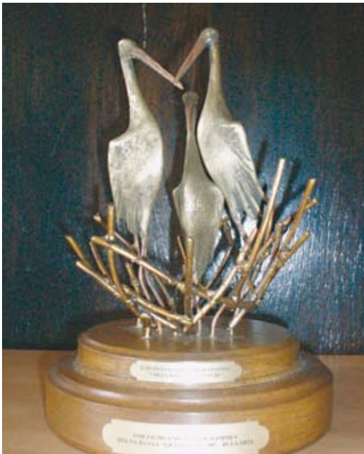
An international jury awards the Stork Nest Grand Prix to films and television programmes dedicated to ecology and environmental protection.

Since its establishment in 2004, the European Environment Film Foundation has developed its 'Green Wave - 21st Century Festival' into a creative international event with activities ranging from film screenings to workshops involving film makers, children and environmental experts. The third annual festival was held this May and hosted 93 films from 24 countries, including the premiere of four WWF documentaries.