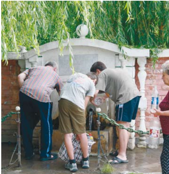
Providing safe and clean water for people and nature is one of the goals of the ICPDR.

Investment projects throughout the basin. There has been a considerable improvement in water quality of the Danube Rivers since 1995. Annual reductions