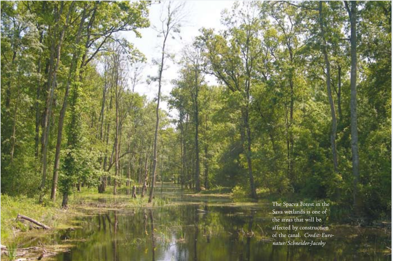
The Spacva Forest in the Sava wetlands is one of the areas that will be affected by construction of the canal.

The Croatian Ministry of Environmental Protection, Physical Planning and Construction (MoE) published the Physical Plan for the Multi-Purpose Canal Danube-Sava in March 2007 and the public hearing was closed on June 11, 2007. Although construction of the canal is planned for 2010, there is a great lobby – including Bozidar Kalmeta, Minister of the Sea, Tourism, Transport and Development, which is responsible for the canal – pushing to begin construction measures in 2007 in order to use 100,000 m 3 of excavated material to build the traffic corridor.